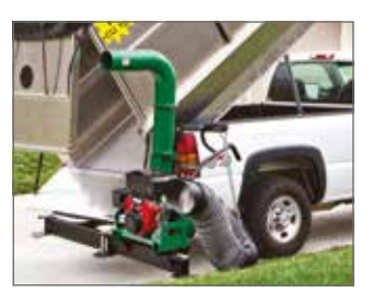
CustomFit™ Swing Away Hitch Locks at 90° and 180° so the unit can be swung away for easy dumping. (SAH34)