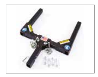
CustomFit™ Receiver Hitch Simple to install and remove and easily mounts to your truck for use with DL13 and 18 loaders. (812601)