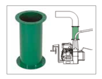
CustomFit™ Extension Kit Extends discharge height by 40 cm. Cannot be used with rotational kit. (791600)