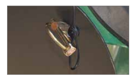
Intake Hose Storage Simple secure nozzle hook for convenient and efficient storage